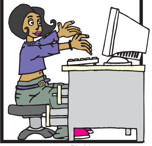
Post Hike EduClub .... "wow, there's a lot of benefits to be an eduventurer! "