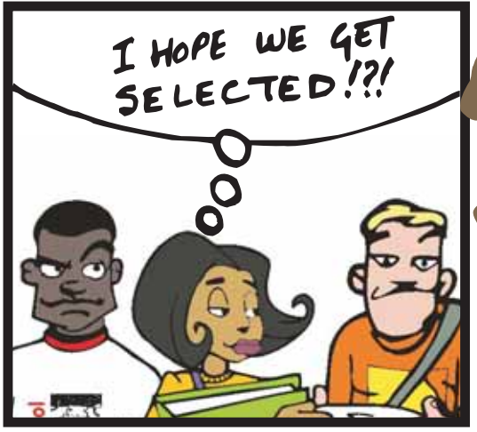
The selection process starts....A <u>visit to the museum</u>, a <u>tough pre-hike</u> and a <u>nerve-racking interview</u>....

Copyright EduVentures 2007: Illustrated by CHRISTOPHER B