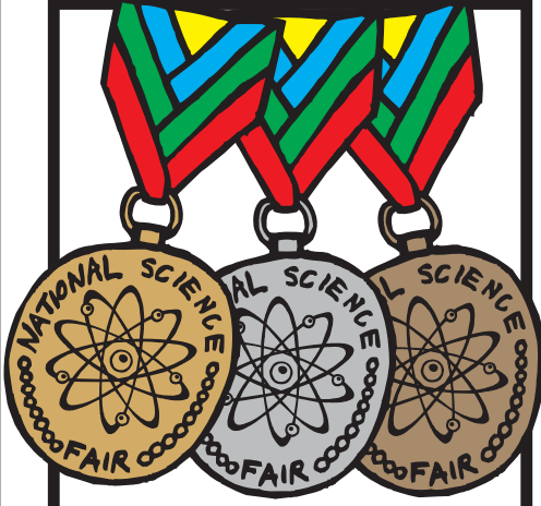
In Namibia there is a science competition.... all three win medals for their science projects.