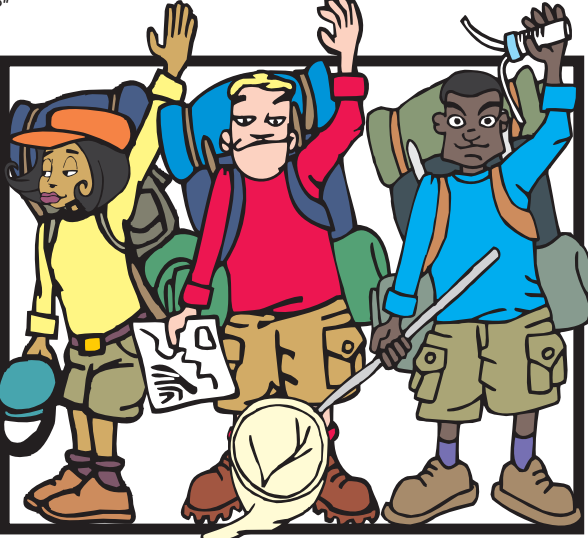
2 weeks of <u>hiking....mapreading....little water....no washing.</u> <u>collecting</u> spiders, scorpions, insects, reptiles, etc, etc....